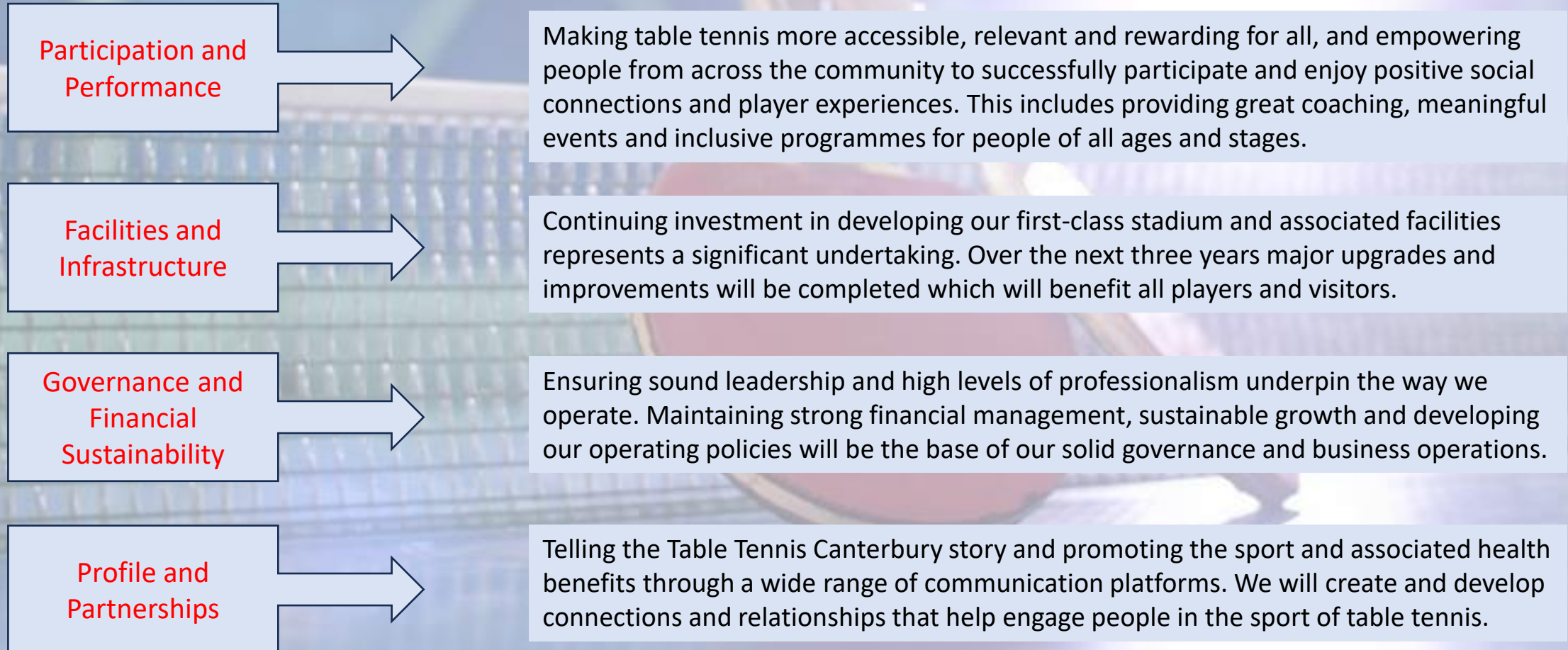
Table Tennis Canterbury has identified four broad areas of priority over the next three years to ensure we hold true to our purpose and make significant progress toward delivering on our vision.