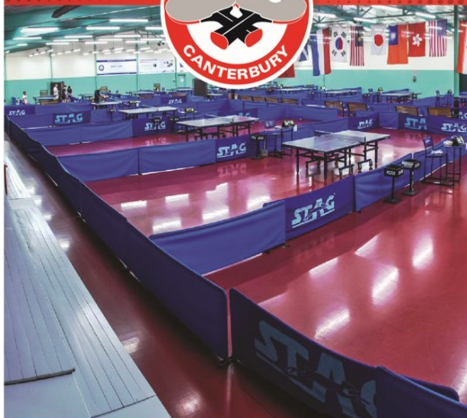
Table Tennis Canterbury

294 Blenheim Road, Upper Riccarton, Christchurch 8041